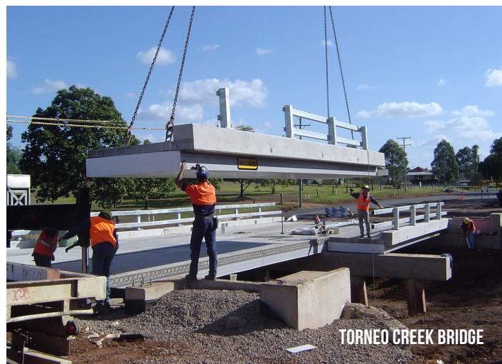
TORNEO CREEK BRIDGE

WAGNERS COMPOSITE PRODUCTS WILL NOT RUST, ROT OR CORRODE ENSURING A LOW MAINTENANCE ASSET WITH A LONG LIFE SPAN.